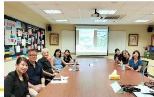
A great conversation with the senior leaders of New Town Primary School to better understand their sustainability efforts.