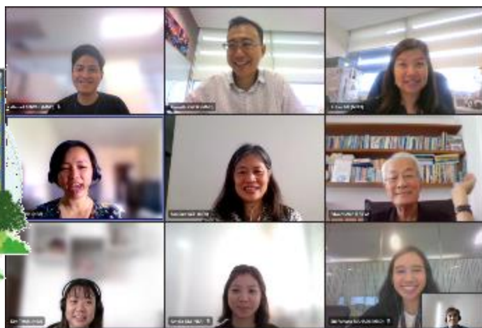
Representatives from MSO and PHC at the meeting for the “Adopt A Hood” initiative.

The Public Hygiene Council recently met up with representatives from the Municipal Services Office (MSO) to learn more about their latest initiative, the “Adopt A Hood” programme. Under this programme, MSO partners with schools and other stakeholders within the community to keep an adopted area in the neighbourhood clean, tidy and neat. This arrangement is done on a long term basis of at least 2 years, and is meant to foster a greater sense of belonging and ownership for the cleanliness of their community.