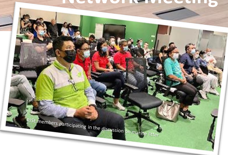
RISE members participating in the discussion on marine litter