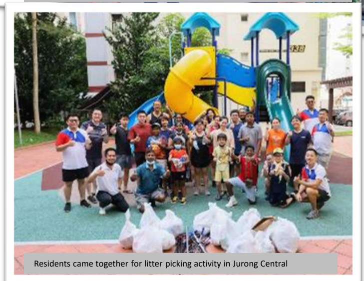
Residents came together for litter picking activity in Jurong Central