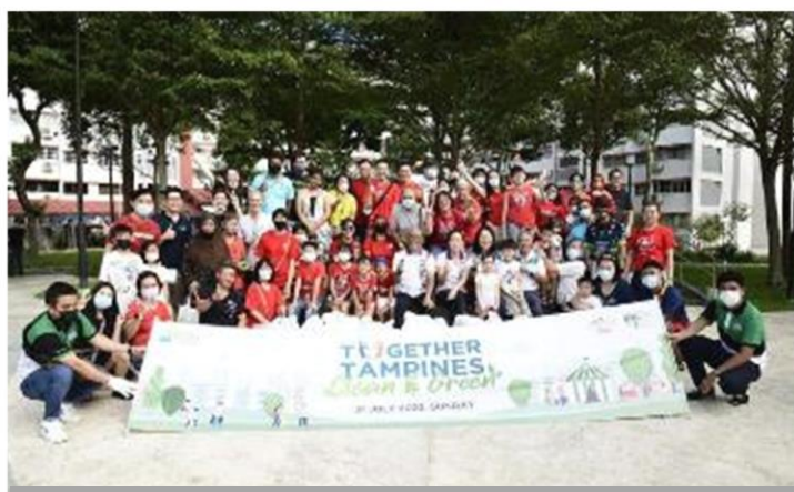
Mass clean-up at Tampines on SG Clean Day

During the online meeting, the PHC shared that many residents in the community are already heavily involved in community clean-ups at residential areas and neighbourhoods around the estate. By combining our efforts and encouraging more residents, schools and students to be onboard the Sustainable Bright Spot programme, it would play a complementary role to the Adopt A Hood initiative and help to entrench the message of keeping Singapore clean. By coming together as one voice and sharing ideas on how we can address public cleanliness issues in Singapore, we hope to move ever closer to our goal of having a truly clean and litter free Singapore.