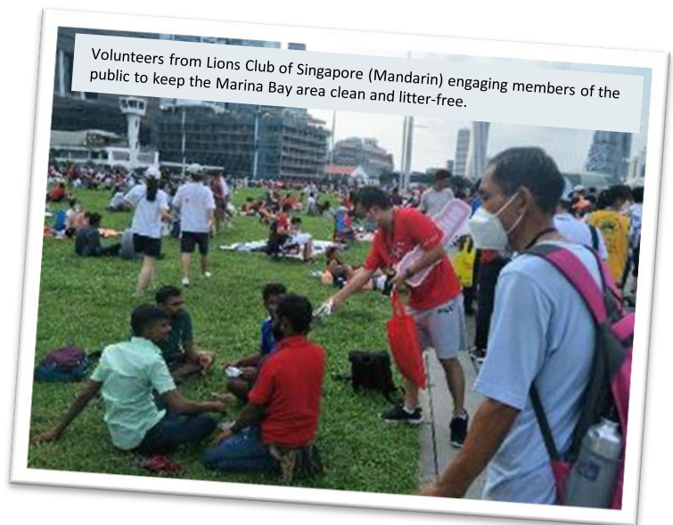
Volunteers from Lions Club of Singapore (Mandarin) engaging members of the public to keep the Marina Bay area clean and litter-free.

Throughout the day starting from 4.30pm till the end of the fireworks festivities at 8.30pm, the PHC's Keep SG Clean volunteers engaged and reminded the public to pick up after themselves, and also picked up litter that they encounter. Let us all take a huge salute in appreciation of Singapore's 57 th National Day and the great work of our #KeepSGClean volunteers!