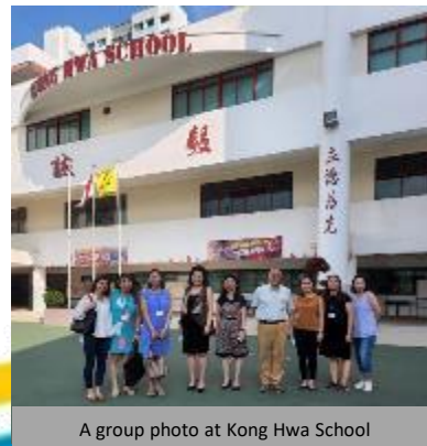
A group photo at Kong Hwa School