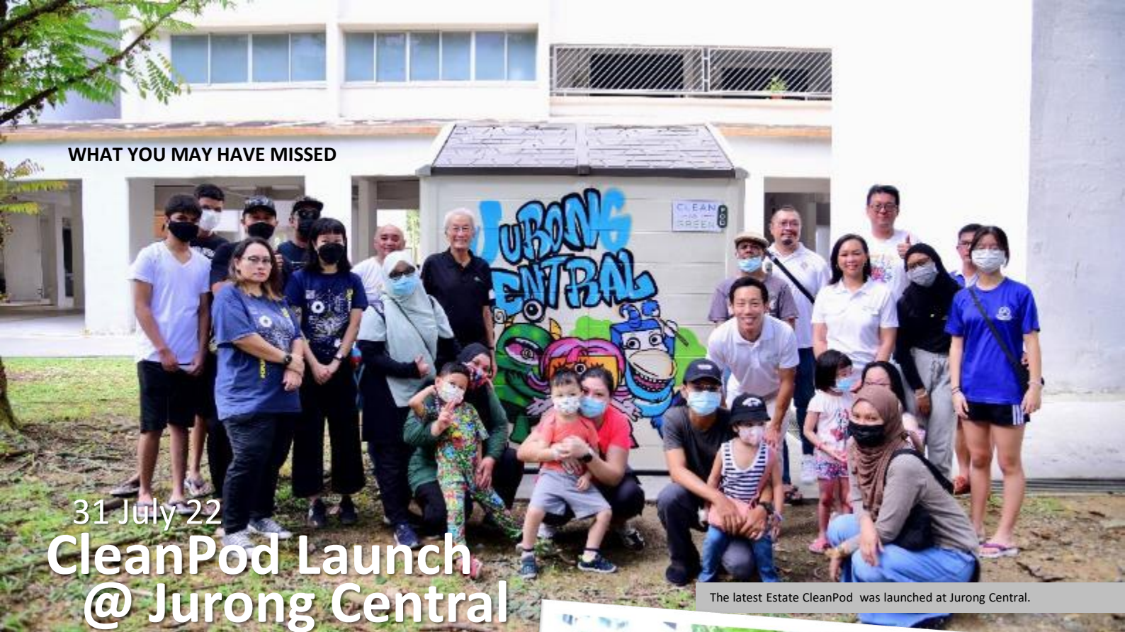
The latest Estate CleanPod was launched at Jurong Central.