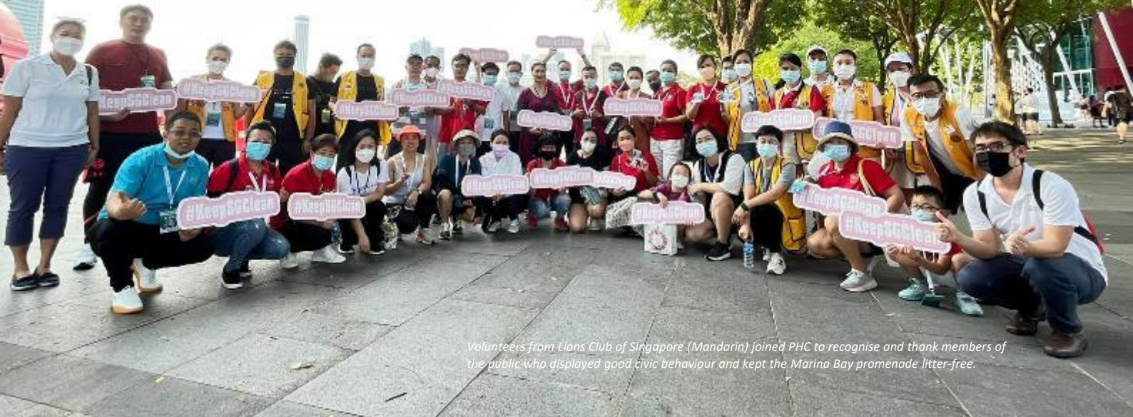
Volunteers from Lions Club of Singapore (Mandarin) joined PHC to recognise and thank members of the public who displayed good civic behaviour and kept the Marina Bay promenade litter-free.

In Singapore, we are fortunate to have a relatively clean and hygienic environment to live and grow up in. To commemorate Singapore's 57 th National Day, PHC teamed up with 40 volunteers from Lions Club of Singapore (Mandarin) to encourage members of the public soaking in the National Day festivities and atmosphere at Marina Bay to keep our beloved country clean and litter-free.