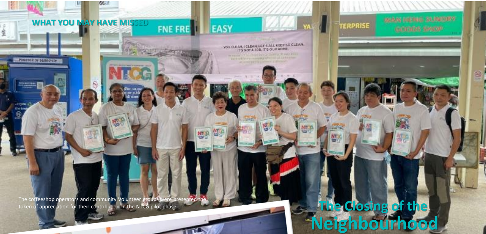
The coffeeshop operators and community Volunteer groups were presented the token of appreciation for their contribution in the NTCG pilot phase.