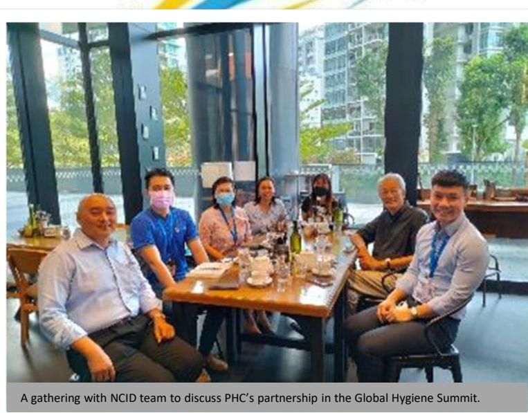
A gathering with NCID team to discuss PHC's partnership in the Global Hygiene Summit.